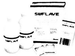
Bottles and packets not shown actual size.

To learn more about this product, please call 1-800-874-6756.